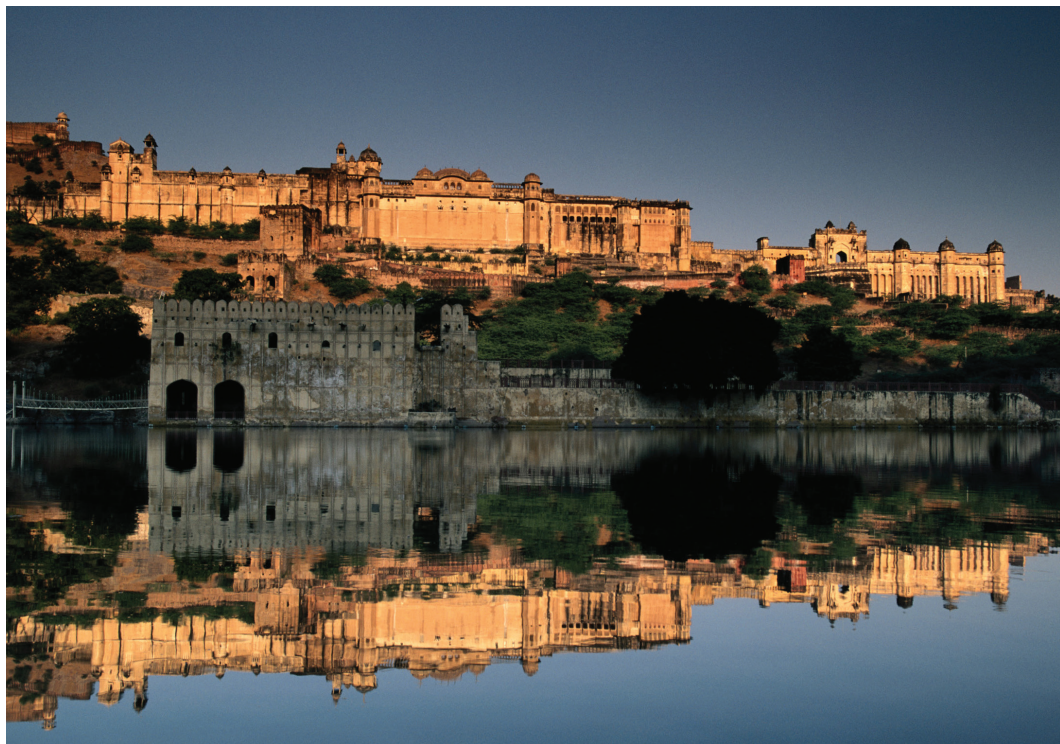
Visit Amber Fort, a UNESCO World Heritage site, on Day 6.

Day 8: Jaipur/Ranthambore We travel today to Ranthambore National Park, the former hunting ground of the Maharajah of Jaipur and now a 512-square-mile natural preserve that is home to hundreds of species of birds, reptiles, mammals, and of course, Bengal tigers. This afternoon we take our first wildlife drive through the park. B,L,D