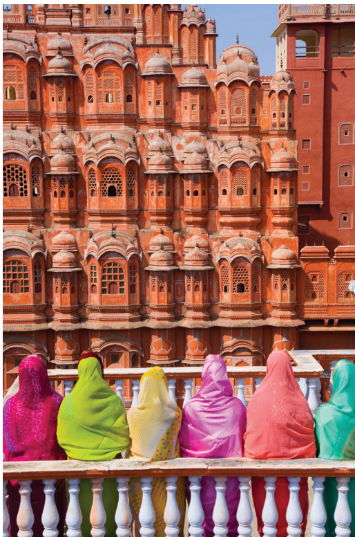
We visit elaborate Hawa Mahal, “Palace of the Winds.”