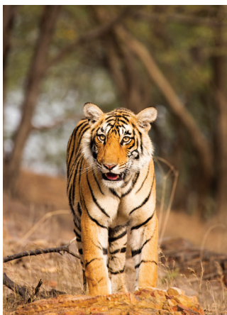
We may see Bengal tigers at Ranthambore.

Day 15: Varanasi Early this morning we return to the Ganges where Hindu pilgrims perform their rituals along the ghats (steps) leading to the river. We visit several ghats by boat as we experience for ourselves the spiritual aura of the hallowed Ganges waters. Then we return to our hotel with time to rest before this afternoon’s walking tour and private performance of classical sitar.