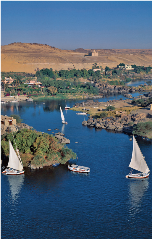
Traditional feluccas sail the Nile.

Day 15: Depart for U.S. Early this morning we transfer to the airport for our return flight to the U.S. B