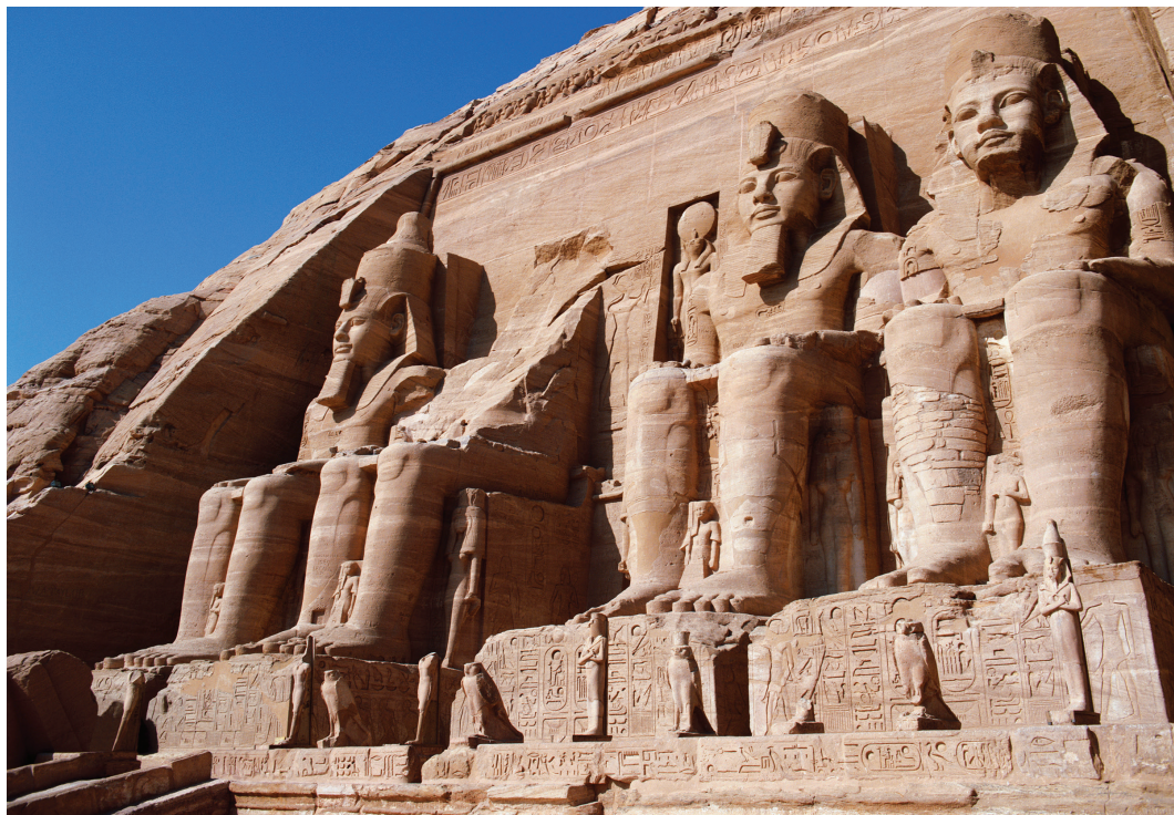
The magnificent temples at Abu Simbel commemorate Ramses II and his queen, Nefertari.

avenue of sphinxes at Wadi el-Seboua’s “Valley of the Lions,” then cruise to Aswan. B,L,D