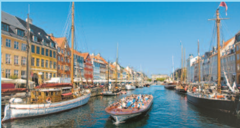
The Vikings' legacy and the maritime character of a traditional Hanseatic city are showcased along Copenhagen's Nyhavn Waterfront.

The evening is at leisure. Optional opportunities are offered to attend a ballet performance held in the Hermitage or Palace Theater or a Russian folklore show performed in the Nikolaevsky Art Center.