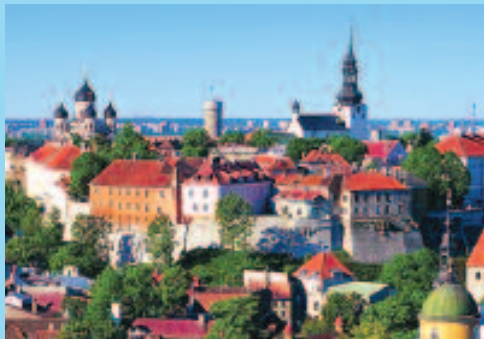
Stroll through Tallinn, a hub of European culture and commerce that retains its history in the 600-year-old spires and gables of its skyline.

This afternoon, experience the treasures of this magnificent city at your own pace, or join the optional excursion to the splendid parklands and palace of Petrodvorets, a UNESCO World Heritage site, commissioned by Peter the Great. Return to St. Petersburg by hydrofoil, skimming over the Gulf of Finland.