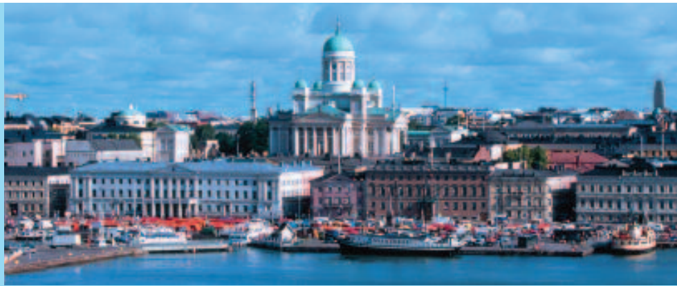
Admire the neoclassical and contemporary architecture of Helsinki, Finland, the “White City of the North.”