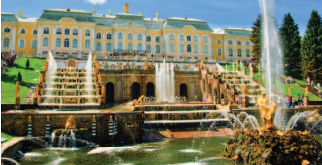
Photo this page: The focal point of Petrodvorets, Peter the Great's summer palace, is the magnificent Grand Cascade, the waters of which start at the Great Palace and flow down to the Gulf of Finland.

Cover photo: In Stockholm's most historic district, the Gamla Stan, stately 17th-century palaces and cathedrals are interspersed with narrow alleys and pedestrian walkways lined with charming bookstores, antique shops, cafés and restaurants.