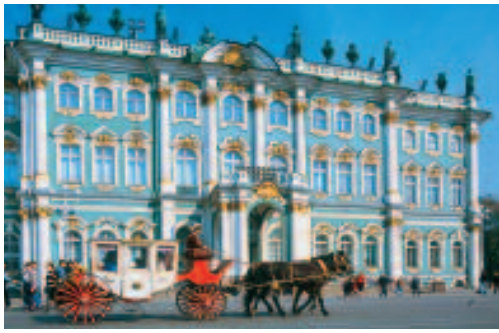
Tour the renowned State Hermitage Museum, once home to Catherine the Great, now the repository of Russia's greatest art collection.