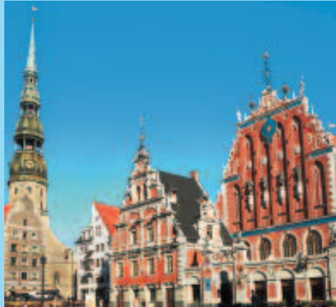
To commemorate Riga’s 800th anniversary in 2001, the town’s citizens donated bricks to rebuild the magnificent 14th-century Blackheads House.