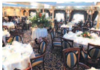
L'Escapade Dining Room