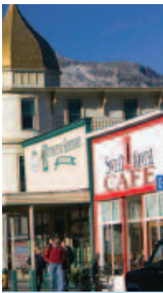
itory, still echoes with the